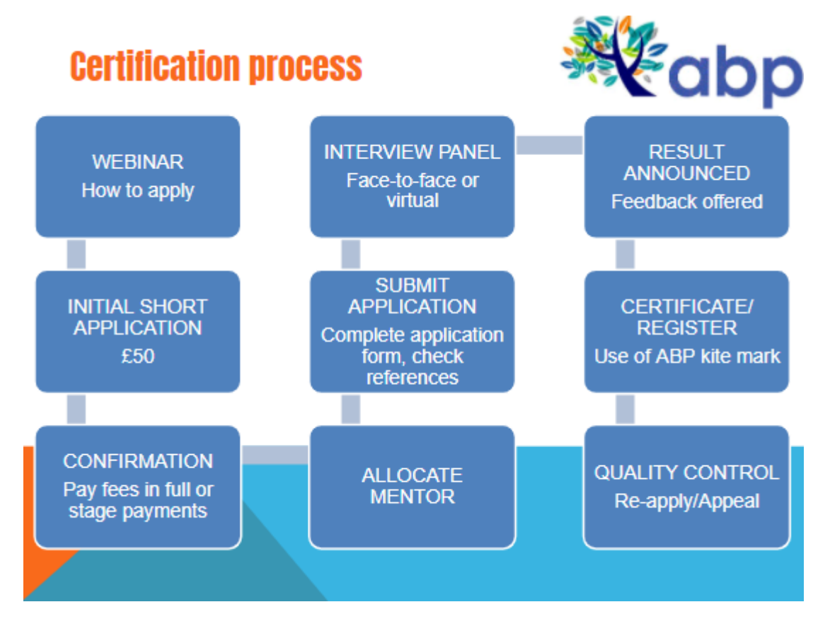
Figure 1: Outline of Certification process steps for CBP and CPBP

Once the detailed application and evidence has been submitted, applicants will be invited to an interview panel to discuss their application with three assessors.